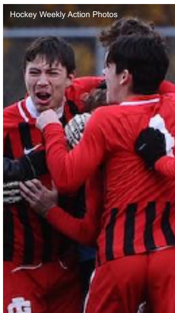
Hockey Weekly Action Photos

Happy Red Devils celebrate the shootout victory in the 2019 D3 title match.