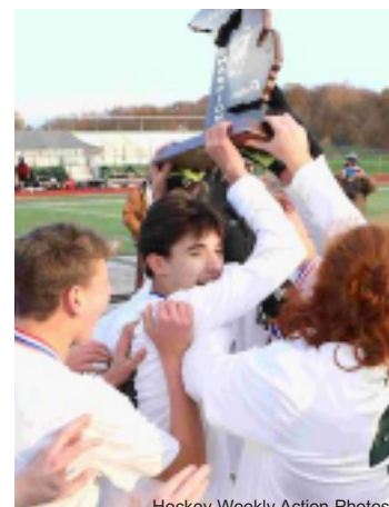
Hockey Weekly Action Photos

Second Half