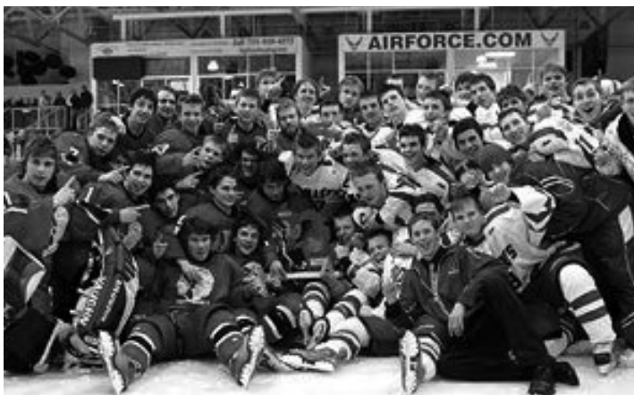
The players certainly didn't look disappointed in sharing the title.